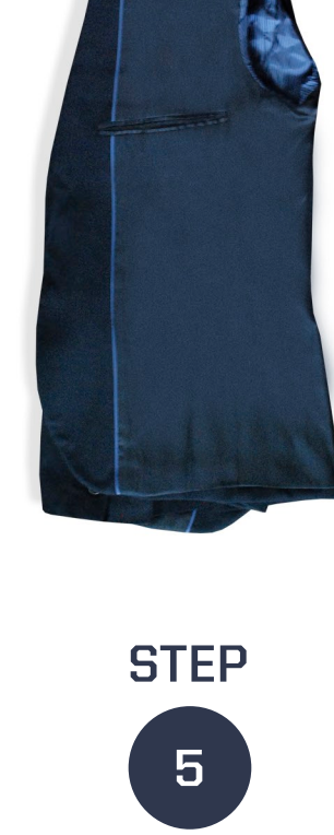
Place your crisply folded suit jacket in the middle of

fold from bottom of jacket to the suit collar.